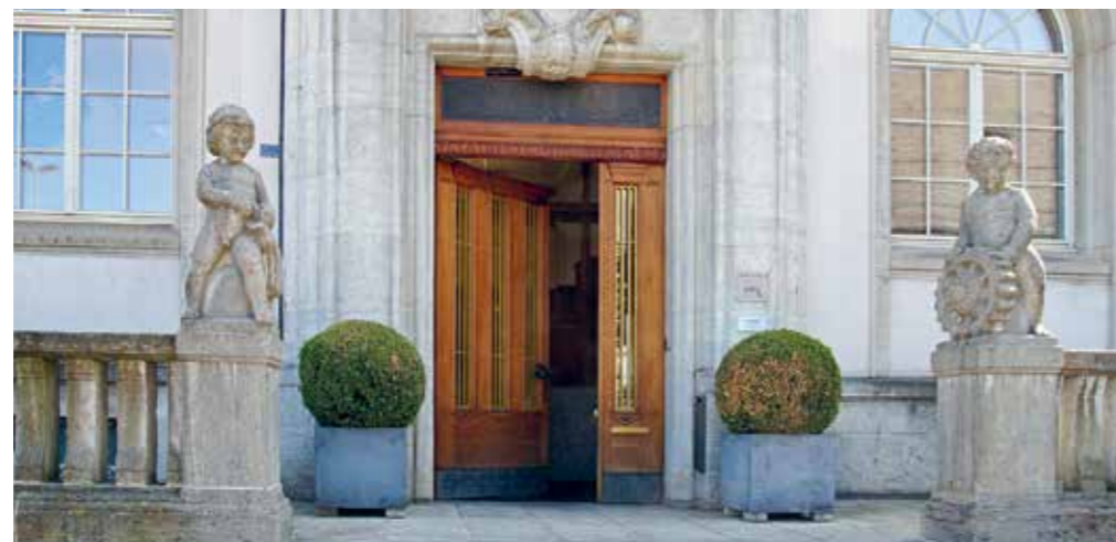
The Location Promotion office - always an open door.

The fact that Appenzell Ausserrhoden is an entrepreneur-friendly location can also be seen from the Commercial Register statistics. For over 20 years, the number of resident businesses has been steadily increasing. Since the turn of the millennium, the number of businesses in the canton has more than doubled.